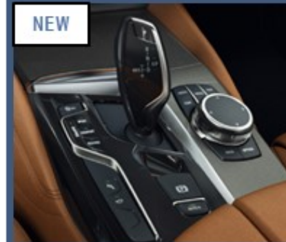
8spd Automatic gearbox

4G LTE connectivity with 3 years over the air map updates / Real Time Traffic Information / Online Search / Google Send-to-Car / Apps / Message Dictation / Natural Voice Control / DAB / 20 GB hard drive / Emergency Call