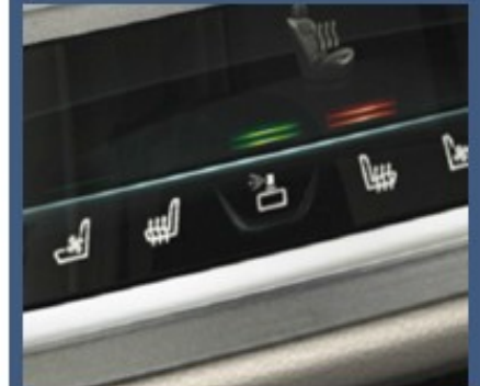
Heated front seats