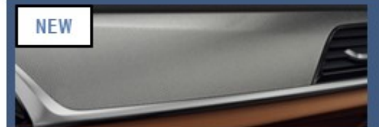
Brushed Aluminium trim