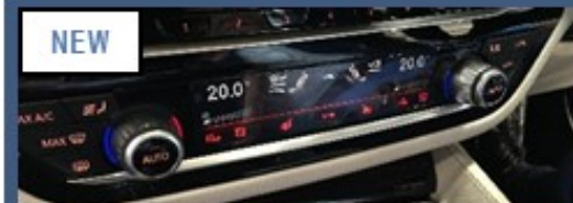
Dual-zone climate control