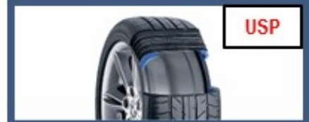
Run-flat tyres (18" +)