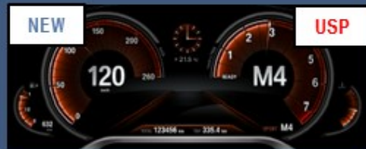
Multi-functional instrument panel