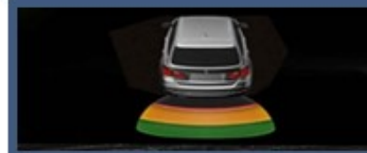
PDC – front and rear